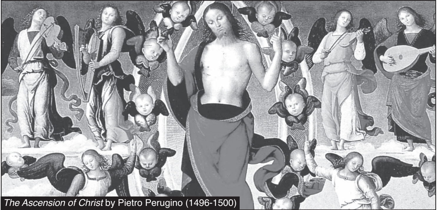
The Ascension of Christ by Pietro Perugino (1496-1500)

St. Basil's Parish is home to people of all ages and needs. For those who need hearing assistance, devices are available at the front desk. Simply leave a photo ID to borrow one during your visit.